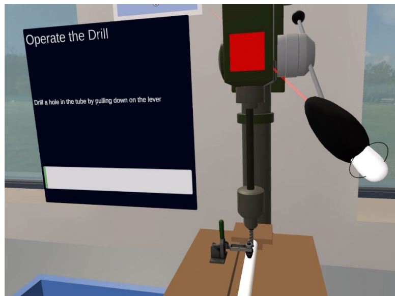
Figure 1 Instruction Prompt for VR Drill Operation

Once these topics were agreed upon then faculty had to determine how to scaffold the learning activities to help guide the students through intended learning objectives. For this implementation, an introductory tutorial was created within the virtual factory that provided an interactive step-by-step instruction to help the students familiarize themselves with the VR environment. Starting with this approach is a proven way to reduce anxiety related to engaging with new technology in the classroom [8]. An example of the VR instruction prompt is shown in Figure 1.