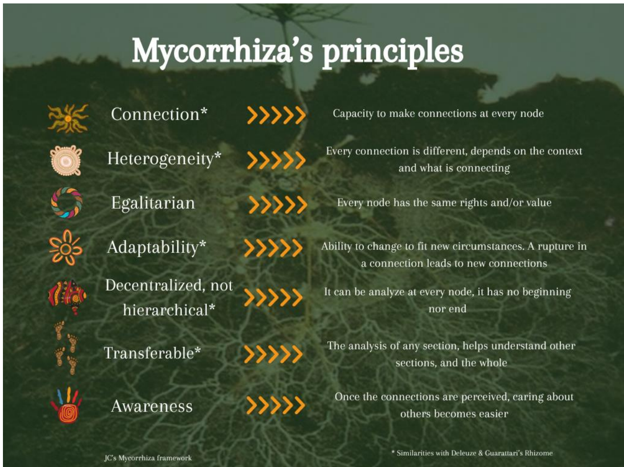
Figure 1. Mycorrhiza's principles

In conclusion, Mycorrhiza is a biological example to represent the complex interconnections between beings (humans, animals, plants, fungi, rivers, rocks, ...) and the Ecosystem. The Mycorrhiza framework uses 7 principles (Figure 1) to describe the characteristics of these interconnections in our inescapable relation to our humanity, people, and the Ecosystem. The purpose of the Mycorrhiza framework is to provide engineering educators with a lens 3 of social and environmental justice.