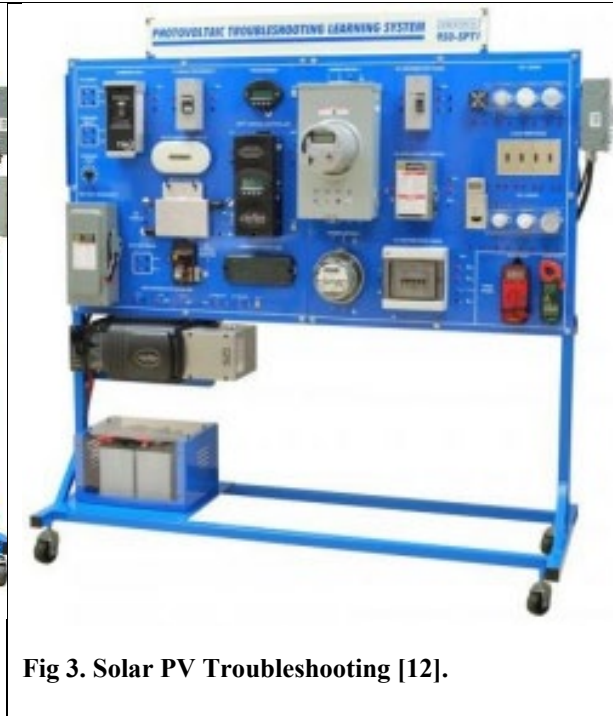
Fig 3. Solar PV Troubleshooting [12].

NJIT's new course, "Solar PV Planning and Installation," involves 2 hours in class and 2 hours of lab time, and it carries three credit hours. Circuits II (ECET 202), a prerequisite course, is available to sophomores and above. The course flow diagram is shown in Figure 4. This course's discussion of solar PV systems includes an introduction to renewable energy and PV systems, solar thermal systems, solar radiation, sun path characteristics, solar panel orientation, wire selection and sizing, ground and lightning protection, installation, startup, commissioning, and troubleshooting. In addition, it covers a variety of practical difficulties for commercial and residential applications, such as identifying and analyzing sites for array locations; developing and implementing a site layout; calculating PV circuit voltages and currents; selecting, cutting, stripping, and connecting wire; and installing components in a PV system.