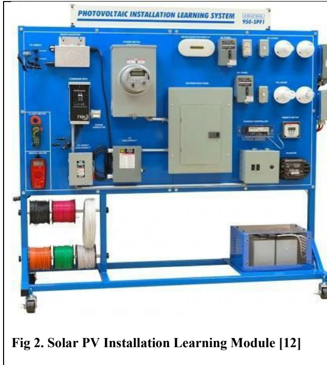
Fig 2. Solar PV Installation Learning Module [12]