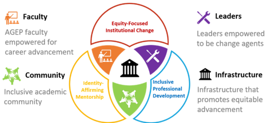
Figure 2. Project ELEVATE Framework

effective in reducing barriers to women of color faculty in engineering [7]. In Figure 2, we display the overall framework of Project ELEVATE, which incorporates these three focus areas and shows their interconnectivity. In addition, this figure shows that institutional leadership, engineering faculty and an inclusive academic community are critical to advancing the work. At the core of the framework for change is the institutional infrastructure that will sustain institutional change in the long-term. Institutional leaders, including our Deans and Associate Deans, will be empowered to be change agents to push the project forward. Through our identity-affirming mentorship and inclusive professional development, we will work toward developing inclusive academic communities at each of our campuses.