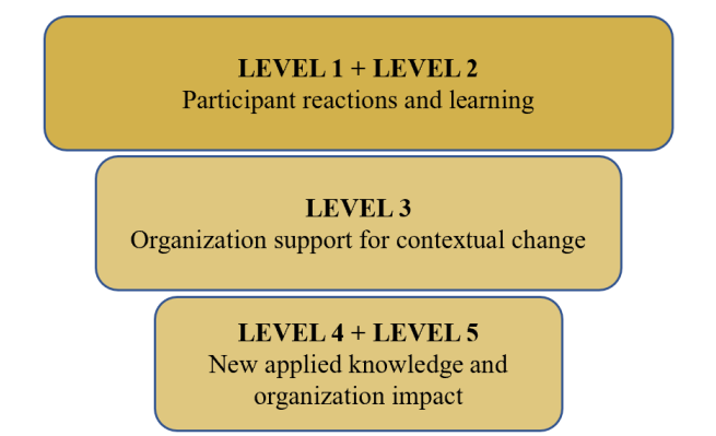
Figure 2. Adapted evaluation framework from [6] [7] models.

To provide formative feedback on the impact of the three short courses for industry on data in manufacturing, we used an adapted framework of the Kirkpatrick Training Evaluation Model [6], combining elements of Guskey's Evaluation Model of faculty development [7]. Kirkpatrick's and Guskey's models have the first two levels (Level 1 and Level 2) in common, namely, assess of participant's reactions and learning. The third level (Level 3) focuses on organizational support for promoting change, accounting for contextual effects. The fourth and fifth levels of the model (Level 4 and Level 5) focus on the use of the new knowledge and skills as applied in practice and the overall impact on the organization. Please see Figure 2 to see how these levels of evaluation are organized.