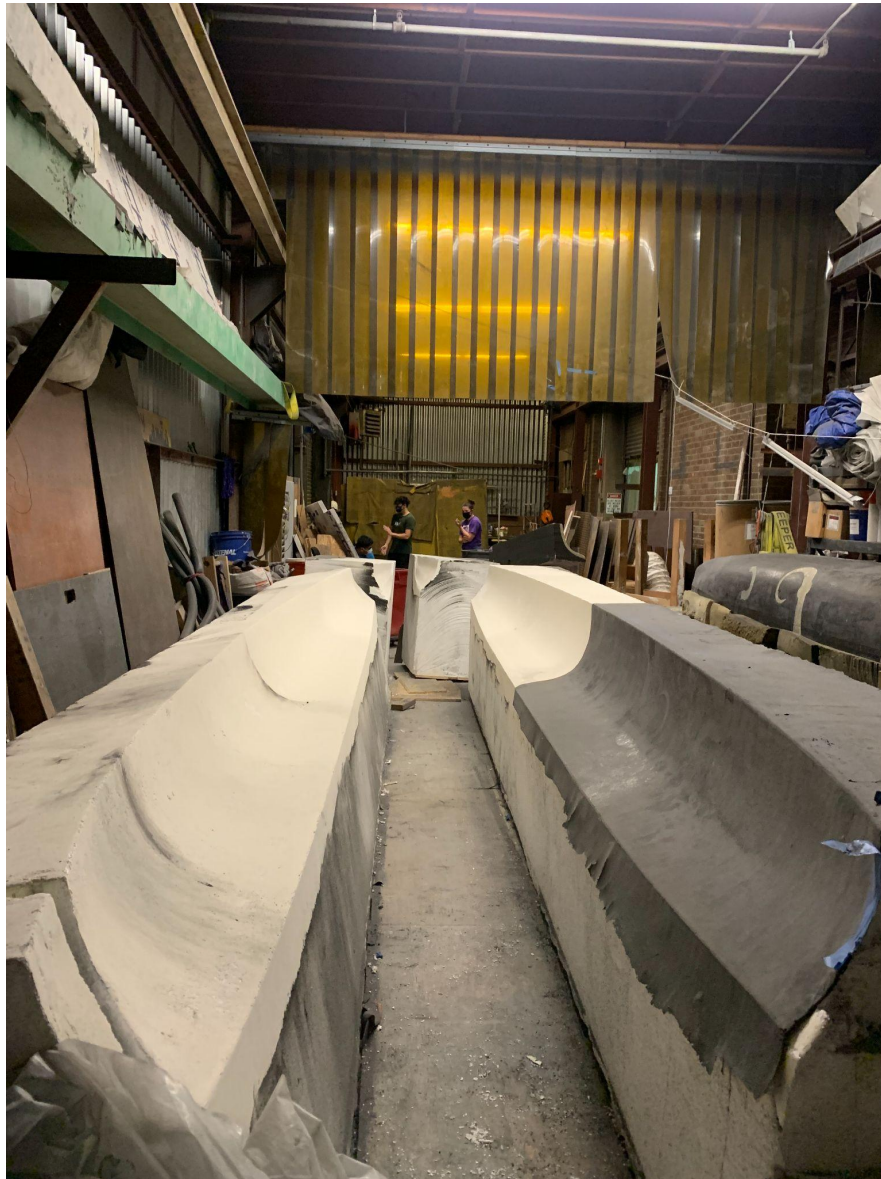
Figure 3: Structures lab used by RedShirt a student for building a concrete canoe.

for classes and co-curriculars, where they were able to learn how to use the equipment such as this description of a photo by a University B student,