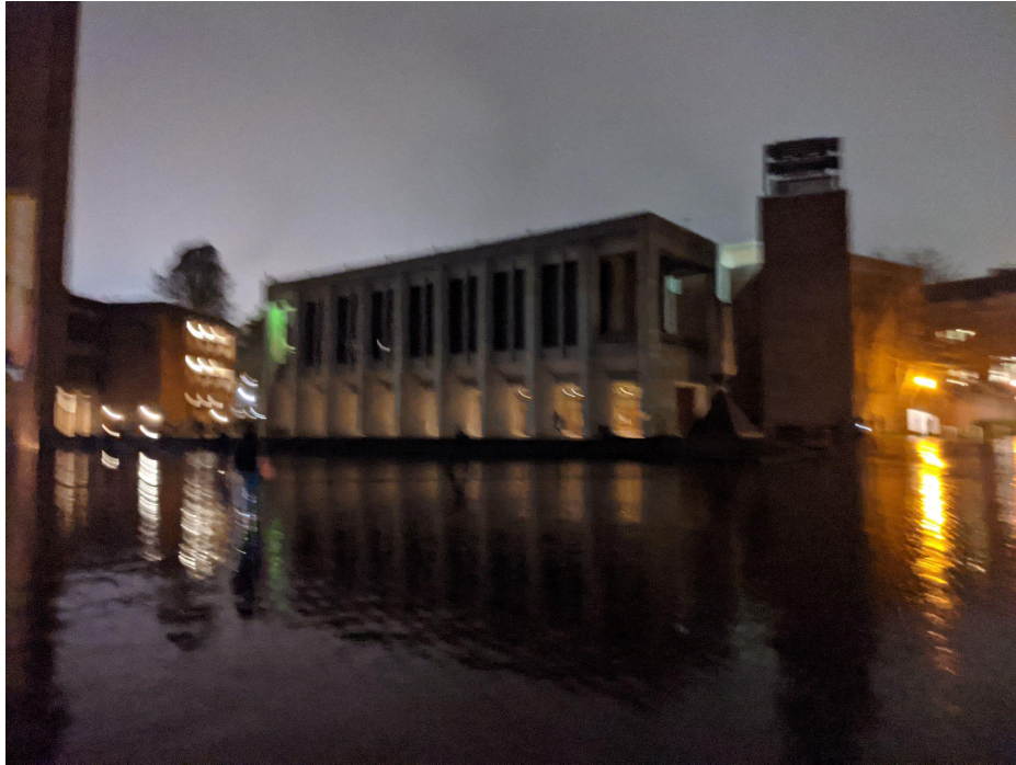
Figure 2: Photo of lecture hall used by RedShirt student for taking a midterm.

In contrast, characteristics for theme 2 that hindered identity development included both large classrooms and online spaces. Large classrooms that served as high stakes testing environments could be intimidating for RedShirt students while online environments made them feel isolated and limited connections with other students. Student comments supported these themes. For example one University B student described their photo as follows,