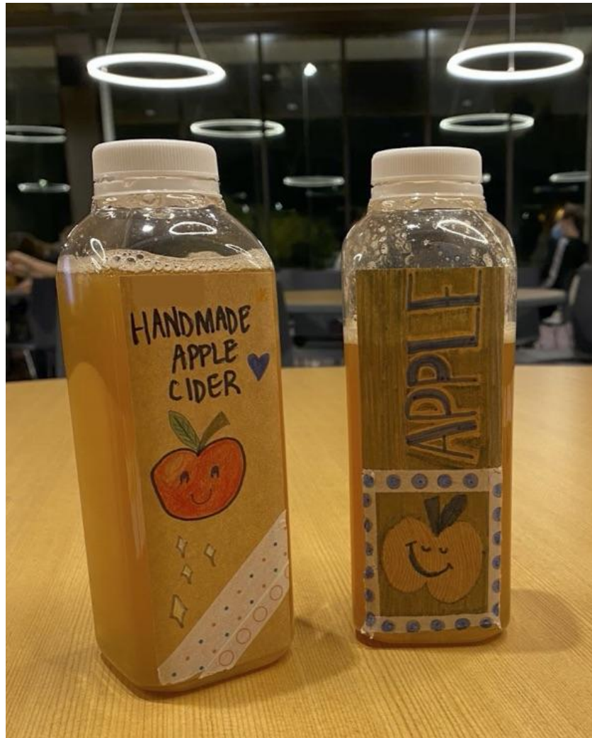
Figure 4: Cider made by RedShirt student to unwind after a test.

Under theme 2, students described spaces where they were able to get together with other students to socialize and plan outside of the classroom setting such as crafting projects, club meetings, and potlucks. One University B student described her crafting project,